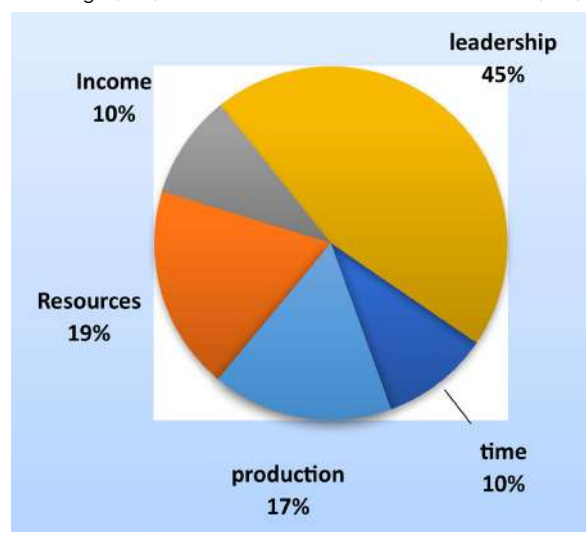
Fig(1) Decomposition Women Disempowerment by Domain

For men, fig (2) shows that the domain of time is the highest source of disempowerment; it contributes to 38% of the male disempowerment index, as their workload is above the poverty line (10.5 h/day) in seasonal work. The second domain is poor access and control over resources (28%) as they are deprived from sole or joint land and asset ownership. The third domain is fragile leadership; it contributes to 24% of the male disempowerment index, followed by little input into production decision-making (7%) and little control of income (3%).