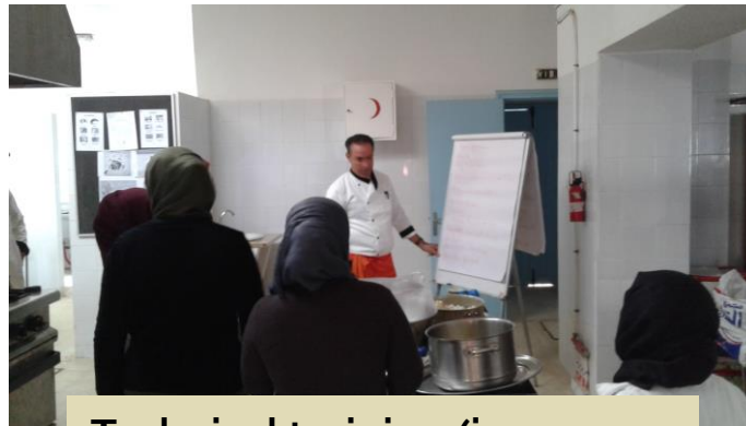
Technical training (in-person, remote technical assistance)