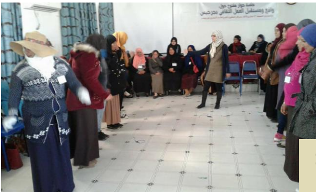
Soft skills training