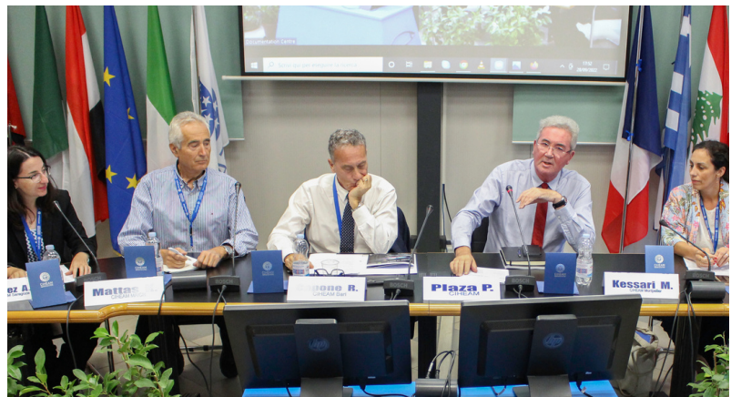
Side event of CIHEAM SFS Working group